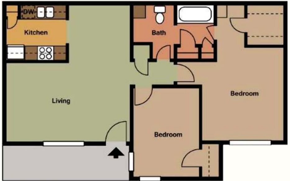
2 BED/1 BATH - 847 Sq. Ft.*