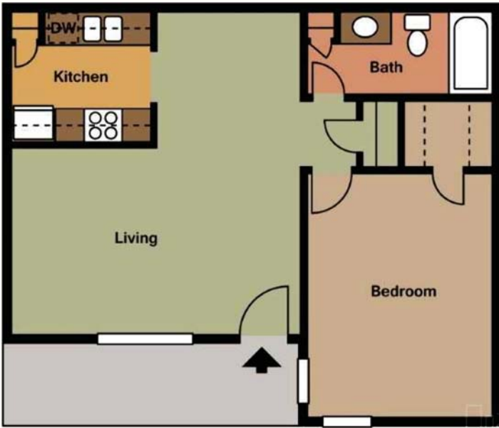
1 BED/1 BATH - 647 Sq. Ft.*